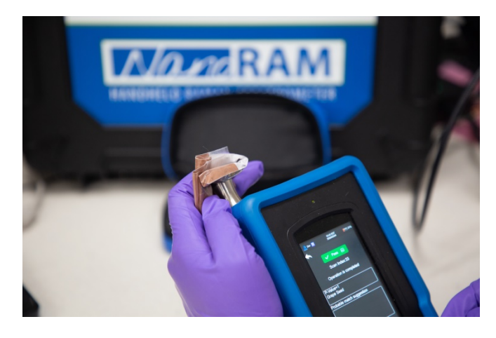
Figure 2. Analyzing Grape seed extract with 1064 nm laser with point and shoot adapter.